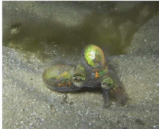
Fig. 1. A mating pair of Euprymna tasmanica in the field (male left).